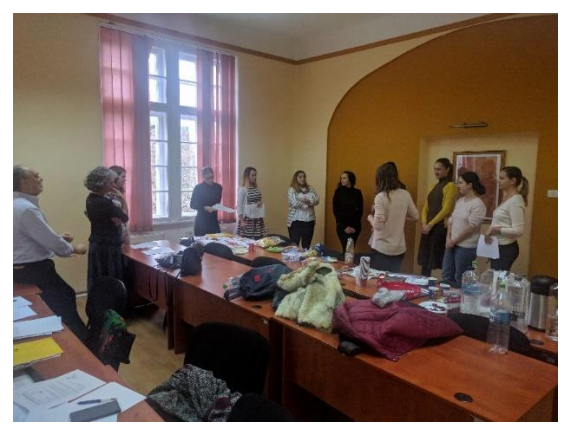
guide to supervise the teams.

Six group leaders, 2 from each country, have now been certified in the ML parent programme after attending weekly supervision during their first parent group. The Romanian group received supervision during the spring/summer 2019 and the teams in Sweden and Spain during the autumn in 2019. The group leaders recorded the group sessions and were then asked to watch the recordings after each session and reflect on how they delivered the programme. What went well? What was challenging? and What would they like feedback on during supervision? The group leaders wrote down their reflections that were then used as a